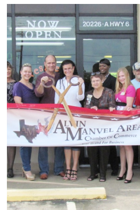
Piece Buy Piece 20226 Hwy 6, Manvel, TX 281-850-1162

Many of her pieces for sale have been donated and she continues to accept donations in the form of items, she has committed to give 50% yearly of donated item's proceeds to charity.