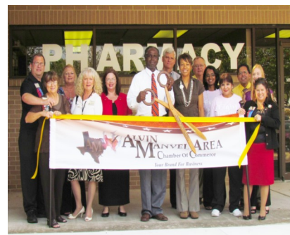
Medic One Pharmacy 400 Medic Lane, Alvin, TX 281- 824-0222

Medic One Pharmacy offers free delivery to Alvin and Manvel, accepts Medicare/Medicaid and most insurance, and offers competitive prices. And "No Wait" prescriptions. Medic One Pharmacy is located at 400 Medic Ln, Suite C, in Alvin.