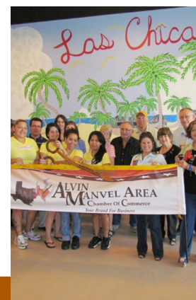
Las Chicas Mexican Restaurant 535 Tovrea, Alvin, TX 281-824-4977

Las Chicas has recently relocated from their previous Hwy 6. location to their newer facility located at 535 Tovrea in Alvin.